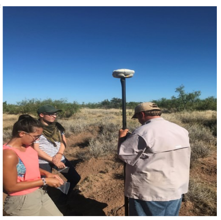
Figure 2. Landmark research team mapping and collecting objects at Macy Locality 371.