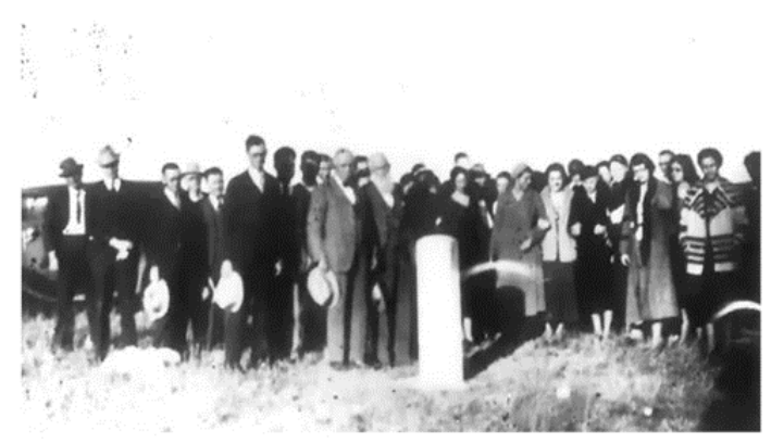
Figure 3. Singer Store marker placement by the Plains Museum Society in 1932.