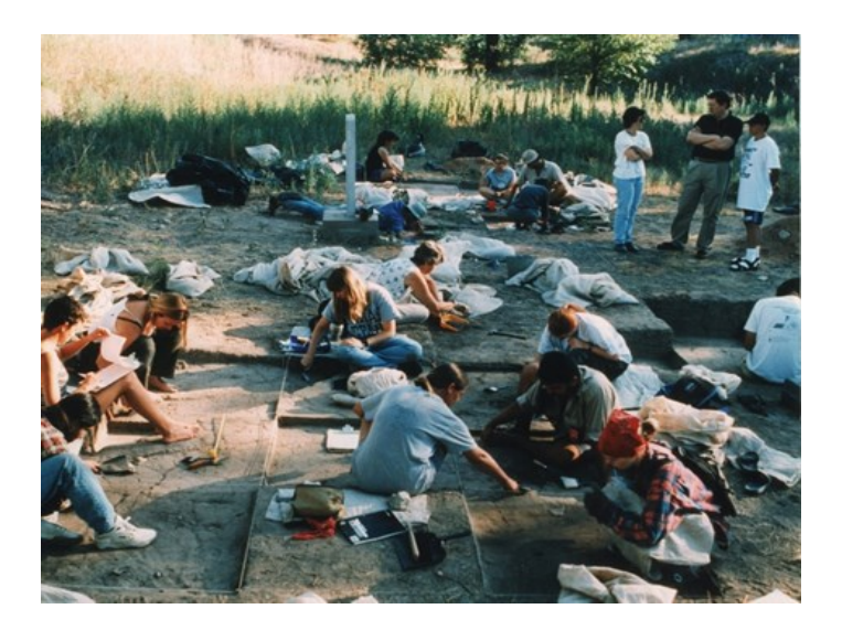
Figure 4. Lubbock Lake Landmark research crew excavating the Singer Store at Area 8 in 1998.