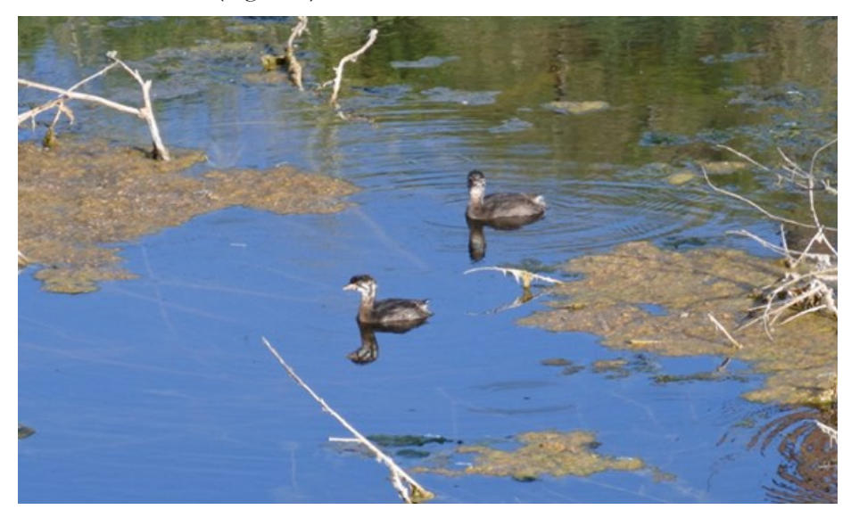
Figure 1. Two juvenile pied-billed grebes ( Podilymbus podiceps ) born and raised in the Lubbock Lake Landmark reservoir.

The water level in the old reservoir at Lubbock Lake Landmark has been rising steadily since 2015. This influx has chased the field crew out of the Area 6 excavation and has submerged nearly all of the late Pleistocene-early Holocene (~11,000-10,000 years ago) deposits at Lubbock Lake. The water is well over 10 feet deep in the eastern side of the old reservoir. The lake now filling the bottom of the reservoir cut certainly has negative consequences for the Paleoindian excavations but has been a boon for plants and animals that prefer the expanding marsh and pond habitats. Cat-tails are abundant along the fringes of the water and aquatic vegetation grows within the Water's depths. Animals have been quick to take advantage of the new habitats. Pond turtles bask in the sun, black-crowned night herons and great blue herons prowl the waters edge, and red-winged blackbirds dart among the cat-tails. A variety of migratory ducks, including cinnamon teals, northern pintails, and buffleheads, among others, stop-over at the re-emerging lake. But, not all of the birds on the water are ducks (Figure 1).