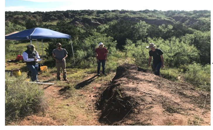
Figure 1 Volunteers excavating at Macy Locality 126 during the 2019 field season.