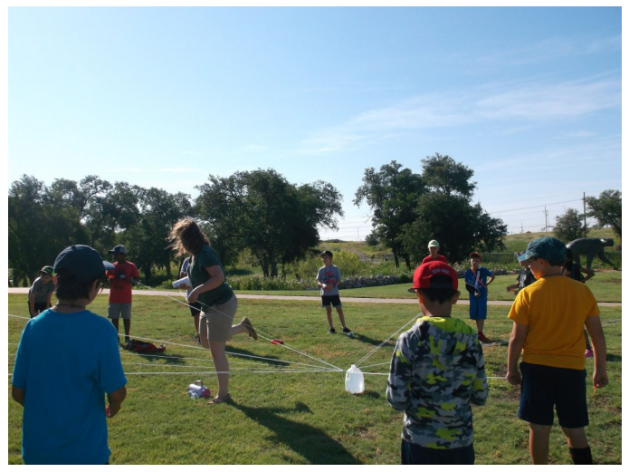
Figure 2. Students learn about water needs during Incredible Journey week.