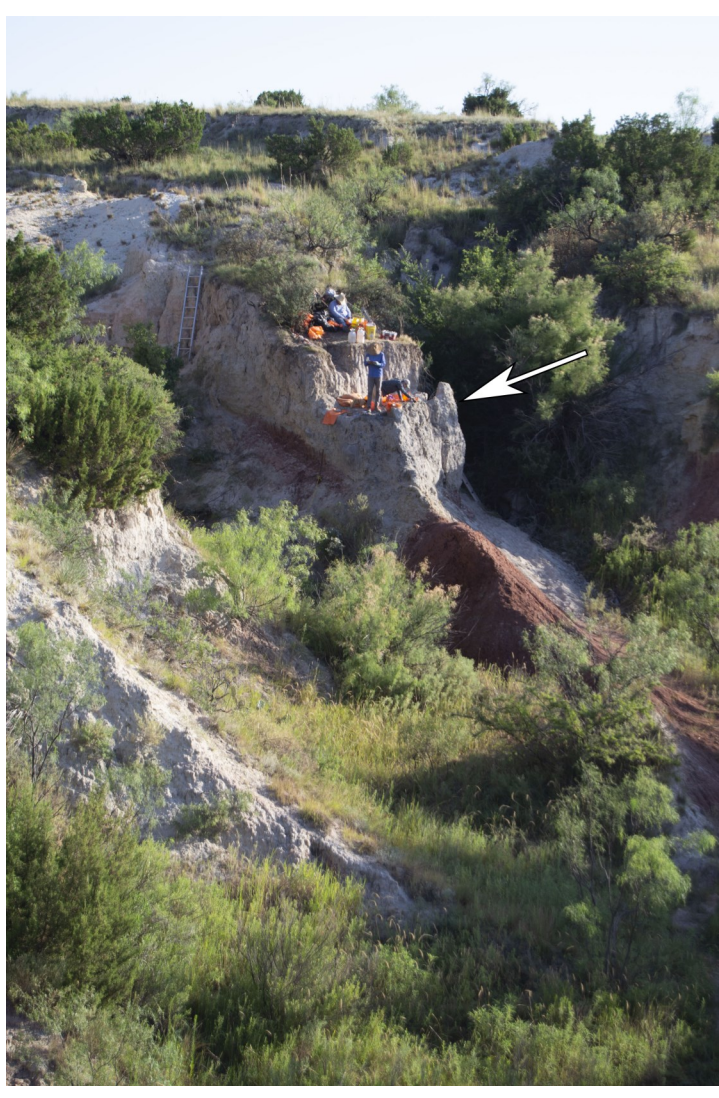
Figure 1. Fieldwork at Macy Locality 370 in 2019. The unstable column is visible as a tower of grey sediment (arrow).

Investigations by the Lubbock Lake Landmark (LLL) regional research program of the sediments, archaeology, and paleontology preserved within Spring Creek on the Macy Ranch in Garza County, Texas, have produced a detailed record of the past approximately 12,000 years. This record extends back into the Pleistocene, a time period commonly known as the Ice Age. Fieldwork in Spring Creek by LLL research teams have collected bones of extinct Ice Age horses, camels, lions, giant tortoises, and many other animals. These bones offer evidence of the animal community that existed on the Southern High Plains 11-12,000 years ago (i.e., late Pleistocene) and help to document how the regional fauna has changed over time.