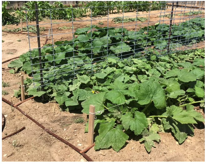
Figure 3. Landmark staff anticipates hearty vegetables throughout the summer.