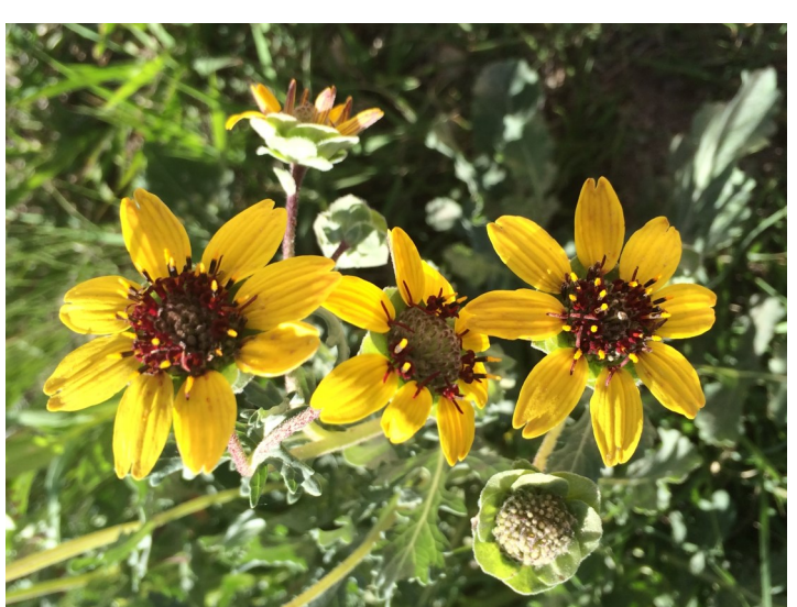
Figure 3. Chocolate Daisy (Berlandiera lyrata)

The Lubbock area is a part of the Llano Estacado, one of the most misunderstood and understudied regions in the state. The typical stereotype is one of a flat, monotonous, and uninteresting landscape, when in fact, the region showcases a magnificently dynamic terrain with striking floral displays unique to this area. It is a beauty that can be experienced at the Lubbock Lake Landmark, one of the region's hidden gems and best kept secrets. On these 325 acres of native prairie, you can find an incredible 190+ species of native wildflowers, cacti (Figure 1), grasses and shrubs! Every spring these plants come alive and grace the landscape with brilliant displays of color and texture. At the end of May and in early June, the American Basketflowers (Centaurea americana) (Figure 2) put on a spectacular floral show and cover the draw in a 2-3 foot high sea of pink flowers. Adonis Blazingstar (Mentzelia multiflora) can only be seen blooming during a Night Hike as the flowers only open after sunset. Throughout the year, you can enjoy the smell of the Chocolate Daisy (Berlandiera lyrata), which has the aroma of chocolate (Figure 3)!