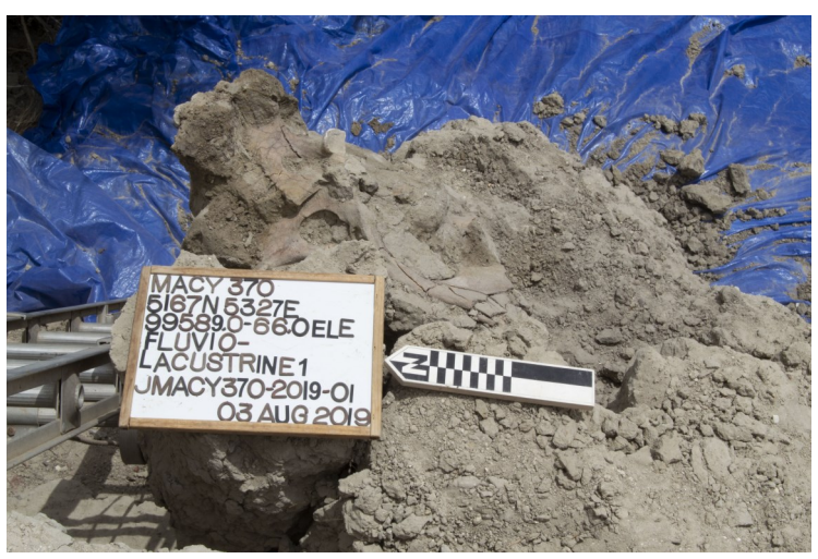
Figure 2. The pelvis of a large extinct species of horse ( Equus ) exposed prior to plaster jacketing.

A few whacks of the trowel broke the jacket loose from column. The plaster jacket, about the size of a small car tire, was scooped up and excavator and jacket scooted backwards down the ladder to the field crew. A successful and exciting first day!