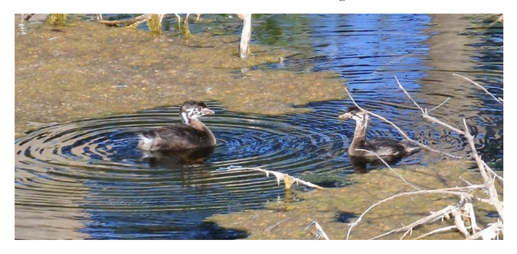
Figure 2. Note the distinctive black and white facial markings of the juvenile pied-billed grebes. Adults generally have plain brown faces.

Pied-billed grebes have a particularly broad geographic range, extending from Canada to southern Chile. These small grebes have been visiting Lubbock Lake since at least 10,000 years ago, based on skeletal remains found at the site. As lake habitats have returned to Lubbock Lake, so have the grebes.