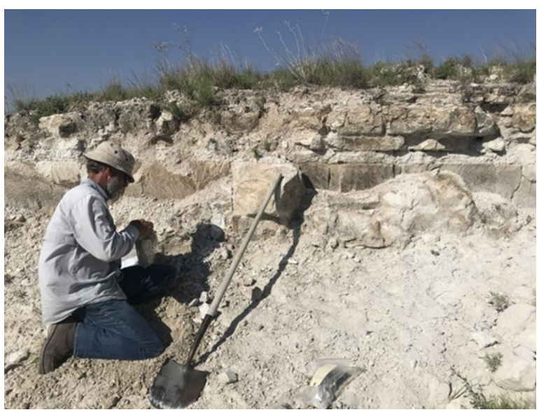
Figure 1. Crew member collects samples from ash beds for ^39/^40Ar dating at the Oregon State Geochronology lab.

Over the past three field seasons at the Post research area, the survey team has recorded the skeletal remains of several extinct Ice Age animals within the Spring Creek beds. The Spring Creek beds are lake sediments left from an extinct lake that had formed during the Pleistocene. During this time, under more moist weather conditions, several paleolake basins formed along the eastern escarpment edge of the Southern High Plains. The exact age of the Spring Creek beds and their relation to other regional extinct paleolakes has puzzled researchers for several decades.