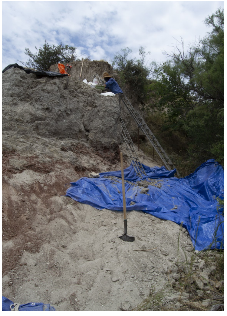
Figure 3. Application of a plaster jacket to the horse pelvis.