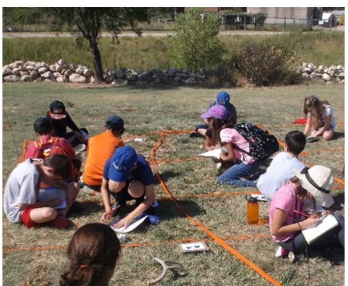
Figure 1. Students practice excavation skills during Archaeology in Action .

Ten years ago, a Kaiser Family Foundation study found that children spend 90% of their time indoors and over seven hours a day on a device; more recent numbers are even bleaker. For many children who live in urban areas, whose recesses are spent on mulch or concrete playgrounds, field trips and structured outdoor programs, like those offered at the Landmark, are some of the few times they have a chance to interact with nature directly.