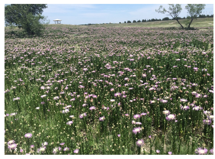
Figure 2. American Basketflowers (Centaurea Americana)

Surprisingly, the Landmark is also home to 9 species of Prairie Clovers ( Genus Dalea ); And that's just the tip of the iceberg of what you can see here!