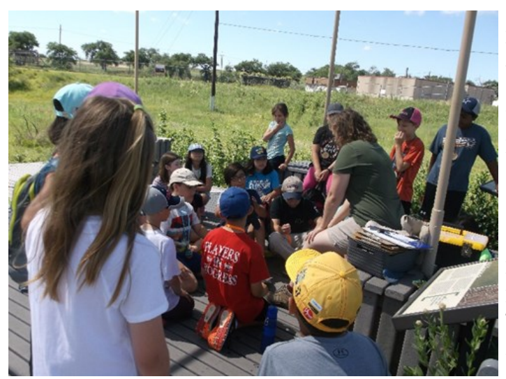
Figure 3. Students take a much needed hiking break during Amazing Summer Adventures .

This year, students spent a week learning about the Biomes of the World and comparing the ecosystems we see around us to those far away. They learned about native species and created wanted posters for common invasive species during Lone Star Species . For Incredible Journey , a week focused on water, students traced the path of a water droplet through the stages of the water cycle (Figure 2). While learning about the different people groups who have lived in the Southern High Plains, students "scavenger hunted" for edible native plants growing at the Landmark and participated in a mock archaeological excavation.