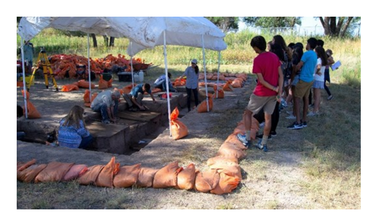
Figure 5. Lubbock Lake Landmark research crew at Area 8 in 2019.

Historic records indicated the original location of the Store and a historic marker was placed at the site by the Plains Museum Society in 1932 (Figure 3).