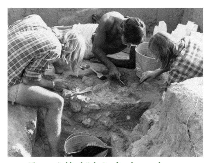
Figure 2. Lubbock Lake Landmark research crew excavating a Protohistoric hearth at Area 8 in 1974.

The 2019 field season at Area 8 marked the 60<sup>th</sup> year since its first archaeological excavation. Although several excavations had been conducted at the Lubbock Lake Landmark following its discovery in the mid-1930s, the very first excavation at Area 8 was in the summer of 1959, led by geo-archaeologist F. Earl Green (Figure 1).