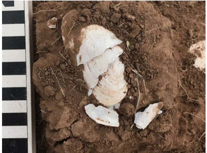
Figure 3. Three mussel shells enclosed into each other.

Mussels are a food source for past peoples, and their shells often are shaped for use as tools or commonly used to adorn necklaces as beads or shaped into pendants. The discovery of this mussel shell feature has led to several questions requiring future research. Identifying the type of mussel shell is first necessary to determine if it is a local species native to the South Fork or was traded from outside of the Post research region. If the shell was traded, then that would suggest the shell was meant for making decorative items or tools. If the mussel could have been procured locally, then this feature probably represents the leftovers from eating them. The mussel shells are extremely fragile and were