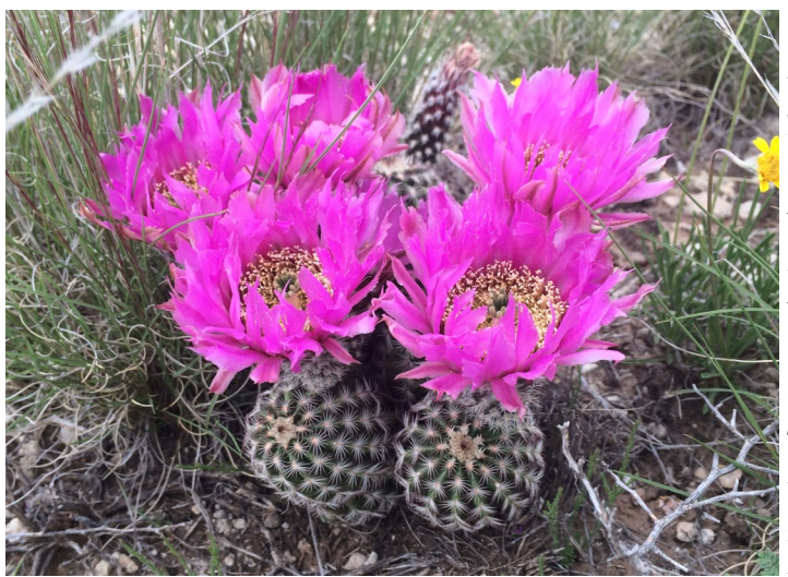
Figure 1. Lace Cactus (Echinocereus reichenbachii