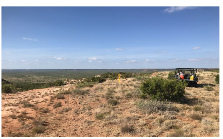
Figure 1. Macy Locality 371 located at the edge of the Southern High Plains near Post, Texas.

Mussels are bivalve mollusks, two valves (shells) that surround the fleshy body. Fresh water mussels such as these live in a mixture of mud, sand, and gravel at the bottom of rivers and creeks. Mussels get food through filtering water for small plants, animals, and algae. They, therefore, require fresh running water. Mussels do not move much and use a muscle foot to burrow within river bottom sediment. During the larvae stage, mussels are parasites and attach to the gills and fins of freshwater fish to hitch a ride along waterways.